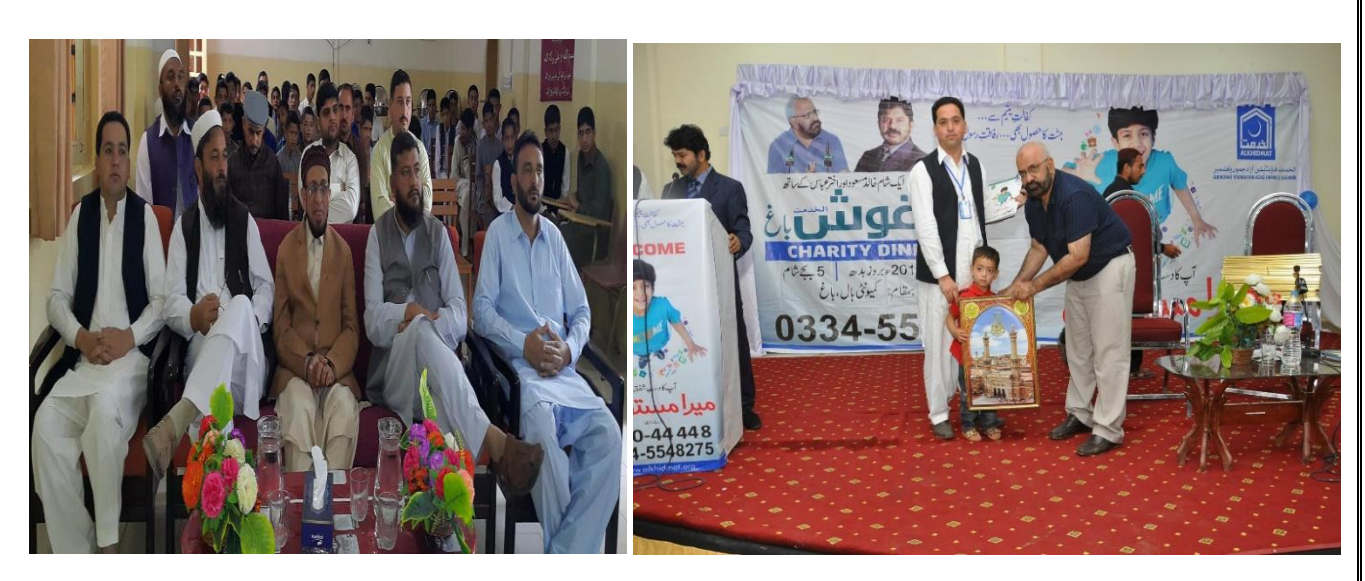
Participation in a Program in Aghosh Alkhidmat Bagh