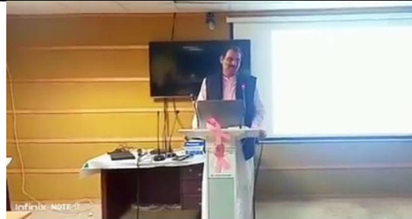
HOD Zoology, with concluding Remarks