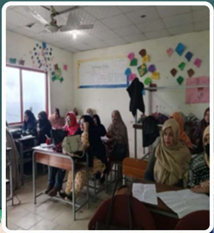
WORKSHOP AT GOVERNMENT GIRLS HIGH SCHOOL NANDRAI BAGH AZAD KASHMIR BY THE DEPARTMENT OF ENGLISH