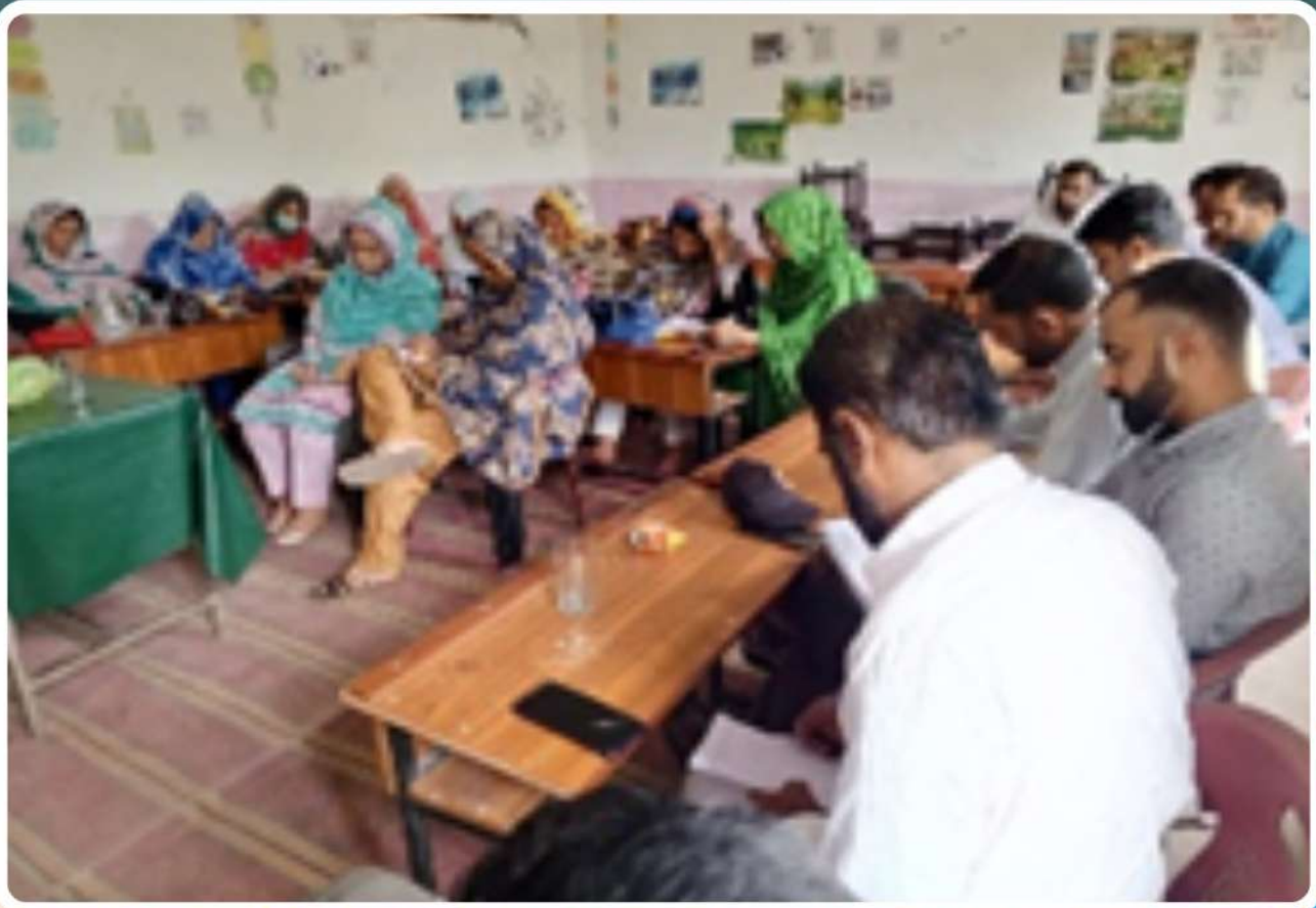
TRAINING AT GIRLS MIDDLE SCHOOL ARJA BAGH AZAD KASHMIR BY THE DEPARTMENT OF ENGLISH