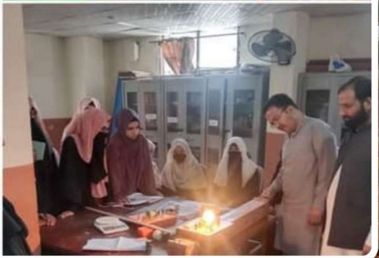
TRAINING SESSIONS BY PHYSICS FACULTY MEMBERS AT READ FOUNDATION SCHOOL AND COLLEGE, BAGH