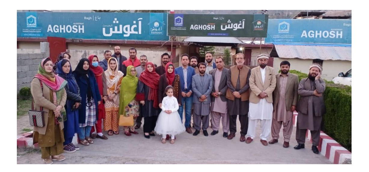
Group Picture of Faculty members of WUAJ&K with the Aghosh team