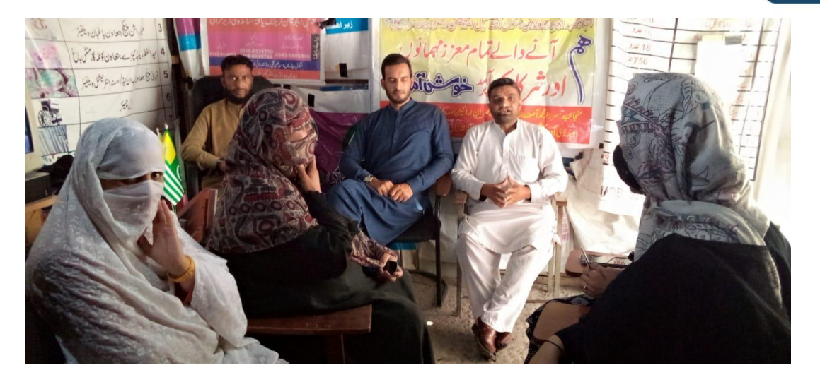
Faculty members of WUAJ&K visited the ALJIZA organization.