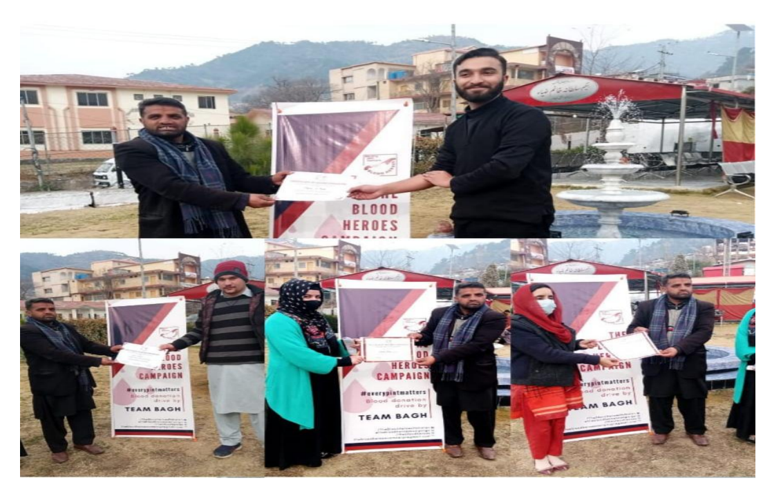
Blood donation by students of women university